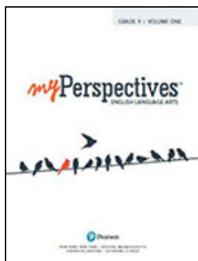
The Interactive Student Edition in Realize Reader.